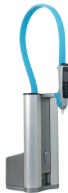
PURELAB flex 1