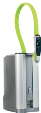
PURELAB flex 3&4