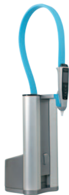
PURELAB flex 2