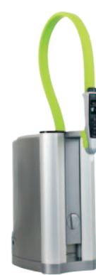
PURELAB flex 3&4